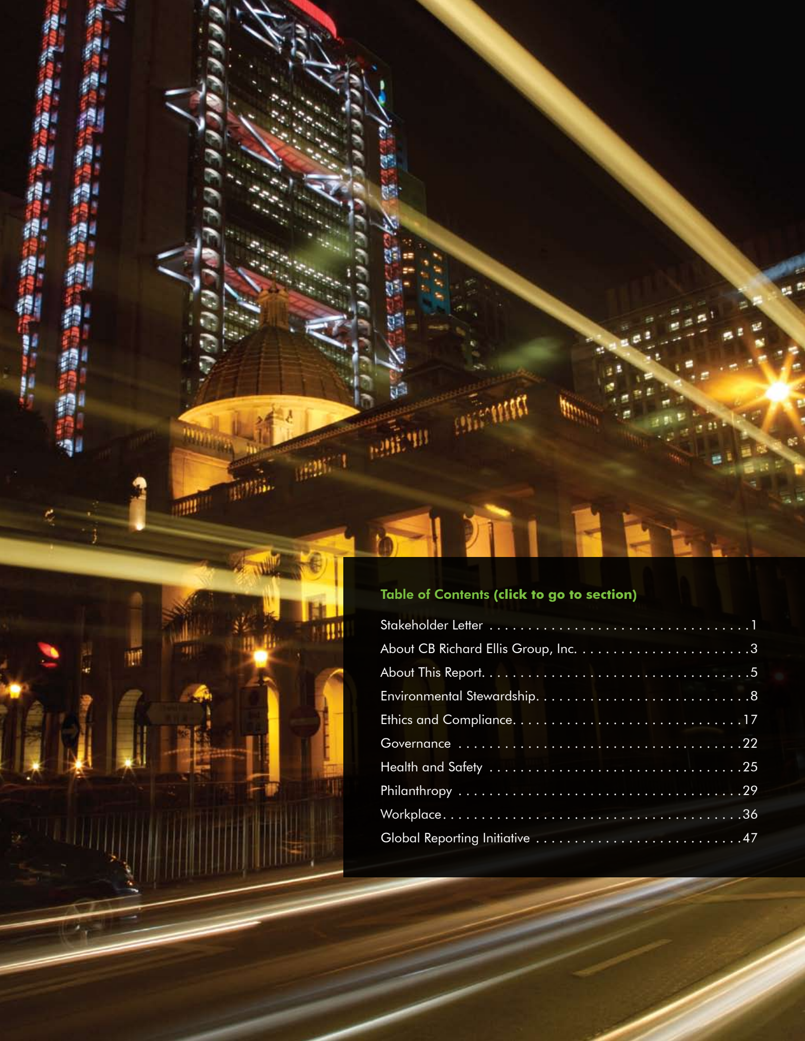
Table of Contents (click to go to section)